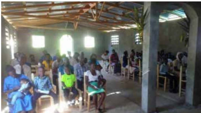
The first service in the new church building in Jacmel.

We have great news from the outskirts of Jacmel—our new church has finally opened! Construction, as most things in Haiti, took a lot longer to complete than originally projected, but God's timing is perfect and the church opened its doors on Sunday September 23rd! The inaugural service had 70 people in attendance, and that number has been growing weekly.