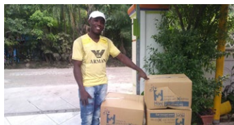
Received and distributed 400 boxes of Mannapacks (protein rice meals), 300 boxes of beans and 30 boxes of Back-to-School kits!