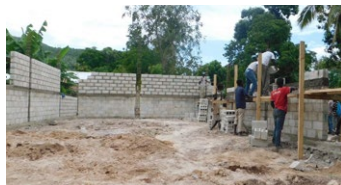
Funds donated to build a church for the new believers in Jacmel