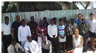
Baptized 24 new believers in April and May, all former voduists